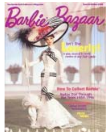
Barbie in Ascot Dress

The Ascot race is the first scene where there is interesting costuming – flower seller drabness with shawls does not do much for your reviewers.