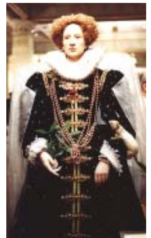
Madame Tussaud's, London, copy of the Pelican portrait gown