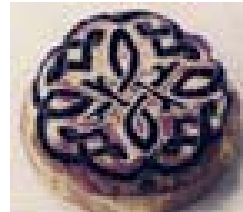
Caul (hat) by Drea Leed

So you don't feel alone in your recreation efforts,