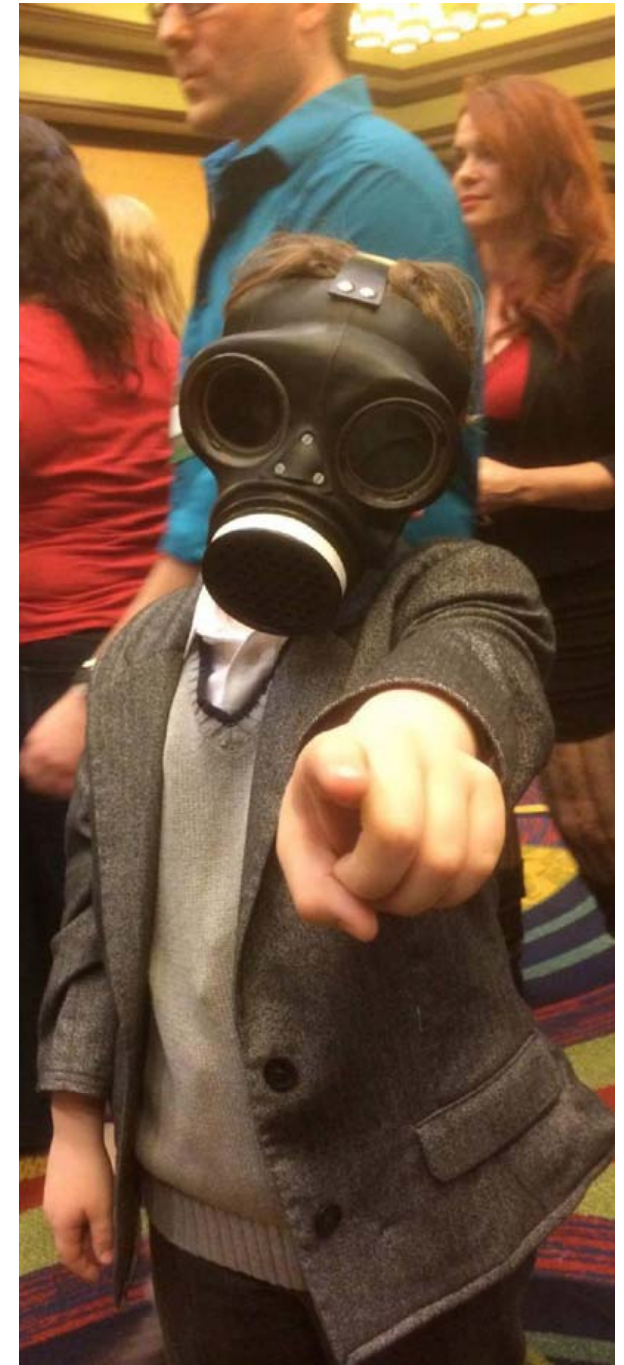
A young cosplayer really got into the spirit of the event.

I really wanted to show you all the sweat that goes into costuming with this kid (right) who was dripping sweat as he was pulled out of his gas mask. When he saw the camera, though, he insisted that it be put back on for the photo however. Rock on little costuming dude!