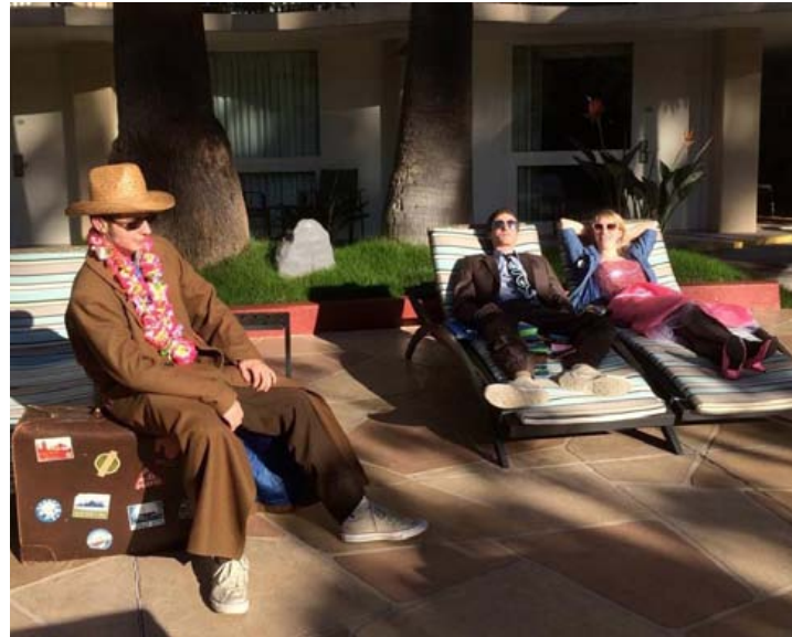
A pair of tenth Doctors in vacation mode.

Another pair of Tenth Doctors in the Karaoke lounge, (below) this time recreating the drunken doctor scene with the tie around the head from "Girl in the Fireplace" while doing the time warp.