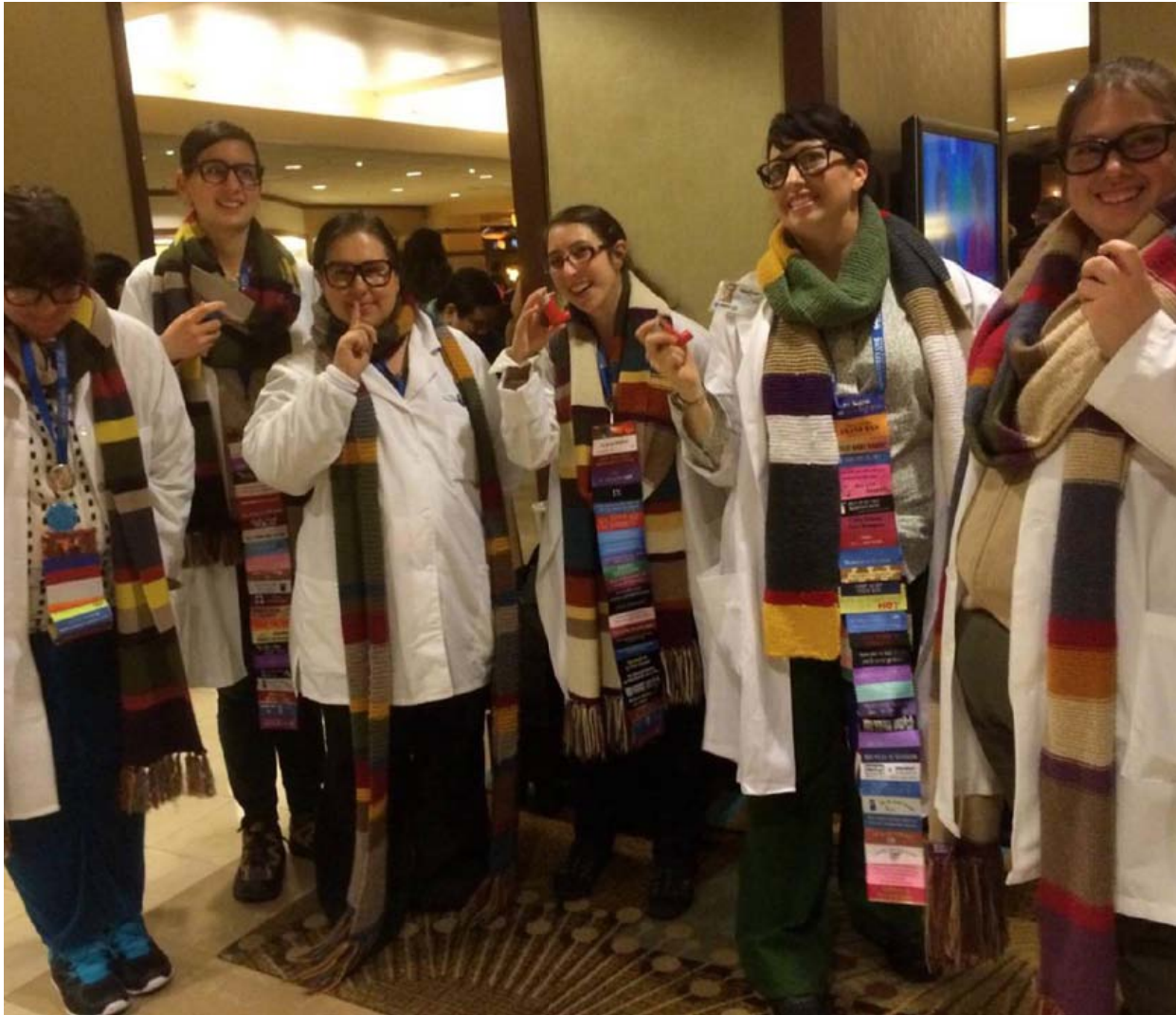
A gaggle of Zygon scientist clones in the lobby.