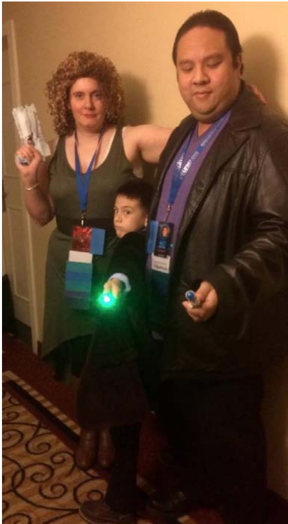
A photo of mother "River Song" with Ninth Doctor father and Eleventh Doctor son.

The family that costumes together stays together. A whole family dressed up as River Song, the Eleventh Doctor and the Ninth Doctor. I didn't have the heart to tell the boy that he was married to his mom (spoilers).