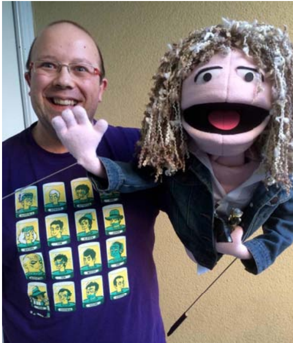
A Doctor Who puppeteer a puppet show.