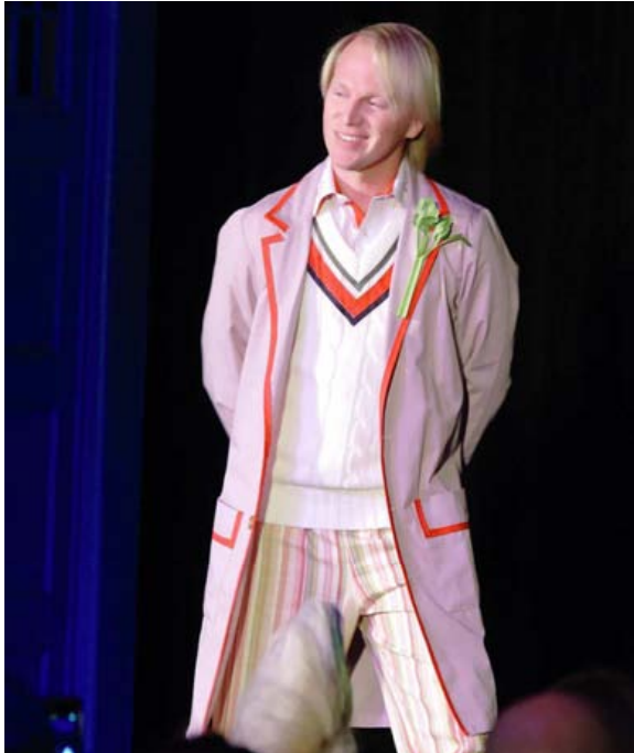
Spot-on Fifth Doctor, straight from the Tardis!

Sometimes you have the costuming skill, sometimes you have the looks. When you have both, you make it feel like the Doctor has actually stepped right out of the Tardis to cheat in the masquerade. This Fifth Doctor (below) was unusually good in costume, mannerisms and appearance. Extra kudos for the awful early 80's hair style.