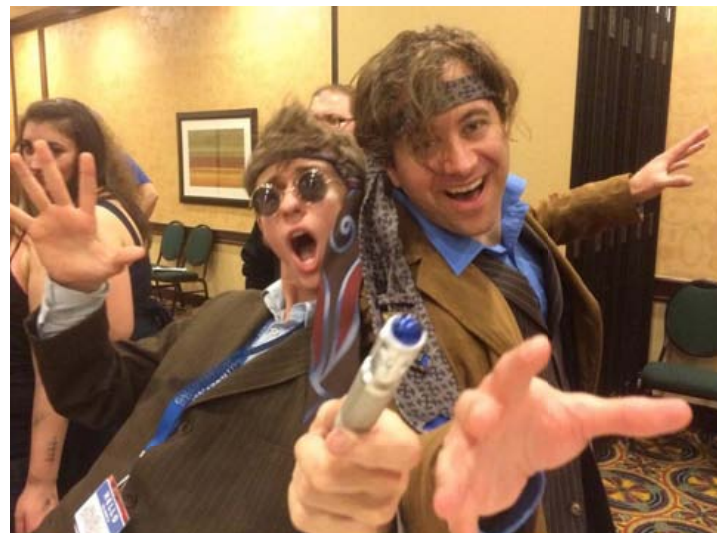
A pair of Tenth Doctors recreate a scene.

Another pair of Tenth Doctors in the Karaoke lounge, (below) this time recreating the drunken doctor scene with the tie around the head from "Girl in the Fireplace" while doing the time warp.