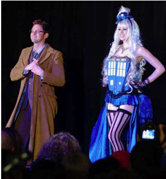
Above: A Tardis dress had some very sexy moves. Below: Female Sixth Doctor with a rainbow umbrella.