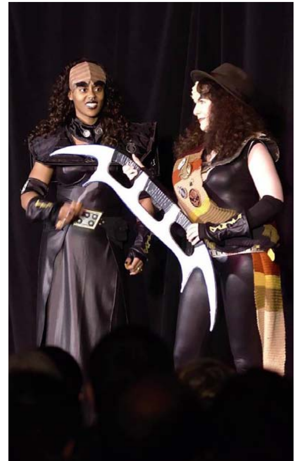
Despite my cross-over reservations, I loved the skit!

While I am generally not keen on crossovers and the recent Star Trek/Doctor Who crossover comic having provided some of the odder costuming moments at the convention, I loved this highly entertaining skit (below) about the time lords looking just like Klingons and the 4th Doctor recruiting a new companion by showing off the sonic bat'leH