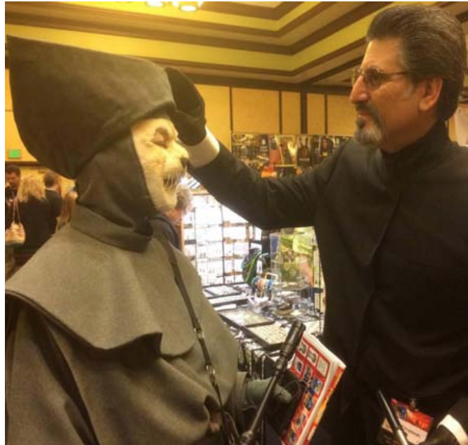
The Master checks the hood of a Novice Hame.

Costuming is always better when you're not flying solo. Here, a Novice Hame (below) is having the hood of her costume checked by her Master costuming buddy in the dealer's room.