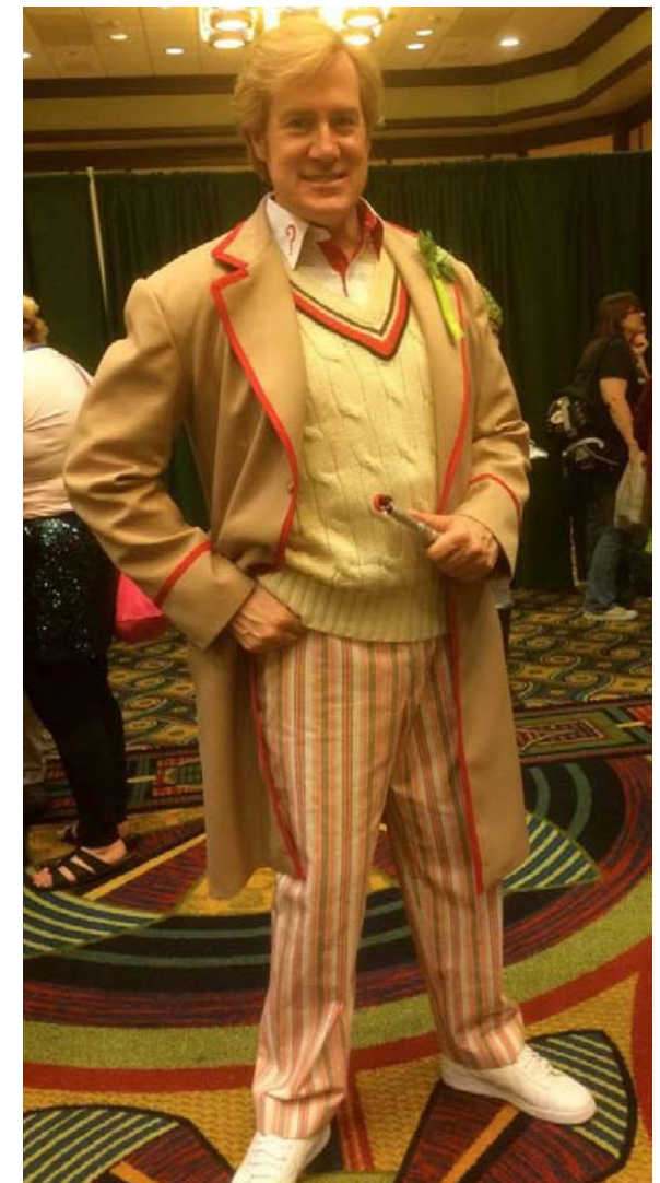
A dapper fifth Doctor.

It isn't just the Tenth Doctor that gets love, I saw pretty much every single doctor represented, by both genders throughout the weekend. Here is a particular dapper Fifth Doctor (below), complete with celery in the buttonhole.