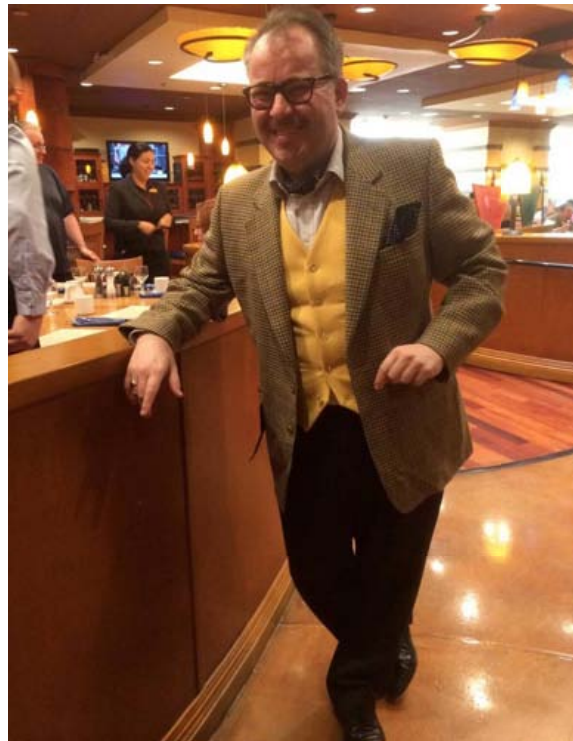
A first-time Gally costumer as Doctor Who creator Sydney Newman.