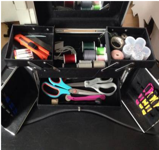
Typical masquerade repair kit.

An extended description of the function of the repair table can be found in Tina Connell's article, " The Function of the Masquerade Repair Table " on the the New Jersey/New York Costumers' Guild website. [See also " What Color is Your Repair Kit? " by Kevin Roche, VC, vol. 8 issue 1, Feb. 2010 , pp 28-30. Kevin credits Tina's as the inspiration for his repair kit. – Ed]