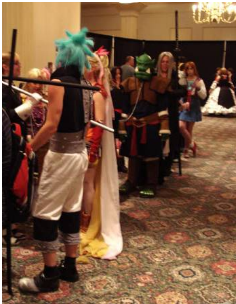
Contestants line up in Green Room to go on stage at Anime North 2009.