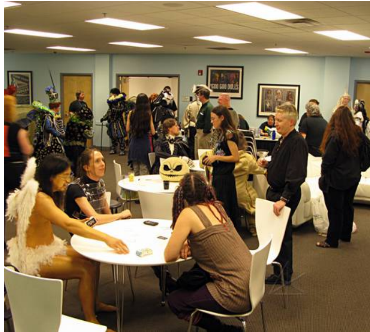
Green Room dens at Denvention 3, 2008.

Occasionally, such large groups may want to set up in space just outside the green room, especially if they want to continue to practice. This probably will not be a problem, so long as you and the Den Mom know where they are and can retrieve them for official photography and workmanship judging, and when it's time to go on stage.