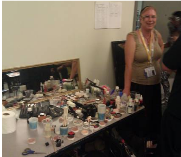
Some Green Rooms provide a makeup table and assistant.