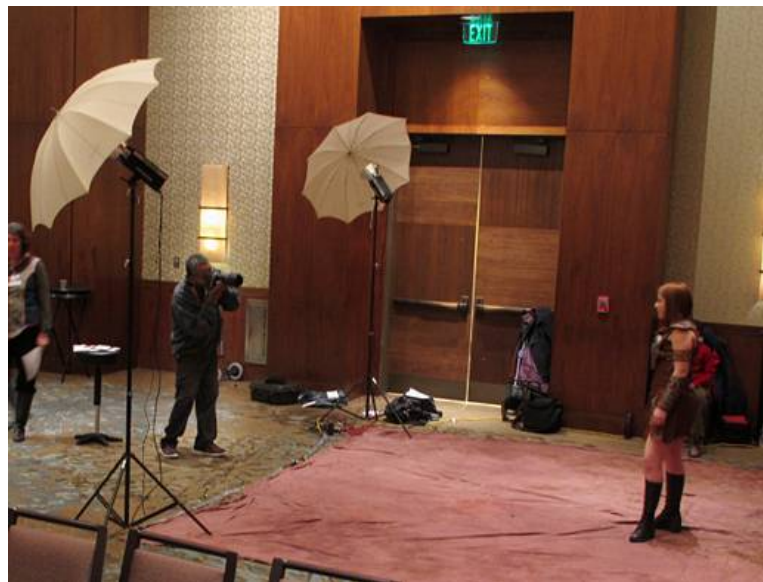
Green Room photography area at Arisia 2015.