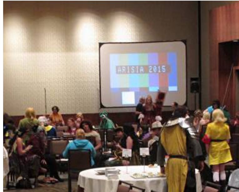
Green Room viewing screen at Arisia 2015.

As early as you can — if possible, before many entrants arrive -- call the Den Moms and Mother’s Helpers