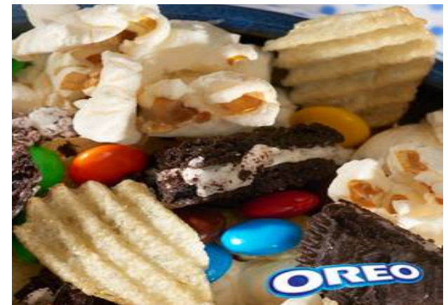
Examples of Green Room snack foods.

Remind the entrants to eat, and that it's OK for them to faint once they've left the stage but that you don't want them to do so before or while on stage.