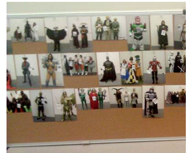
Official photos on Green Room bulletin board.

Usually, all entries are required to have official photos taken. It normally is most convenient to have the official photographer set up in (or immediately adjacent to) the Green Room. However, official photo will take up as much space as you let them get away with. You should work with the photographer to determine a reasonable amount of space for a backdrop and to pose entries, with a clear path from the dens and space for entries to wait to be photographed.