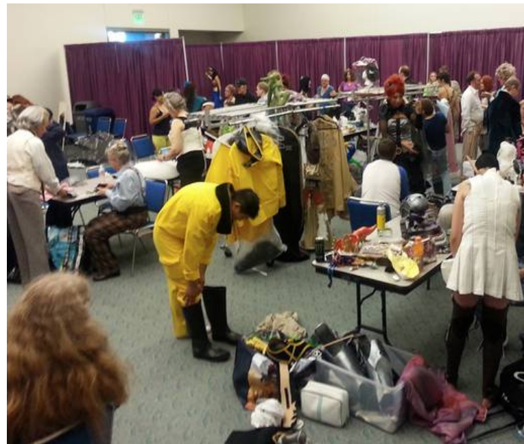
Entrants putting on their costumes in a Green Room common area often also socialize.

together to brief them, pointing out the locations of the official photographer, repair table, workmanship judge, and food; telling them where the bathrooms are; giving them a chance to walk the route from the green room to (and on) the stage; and letting them ask questions.