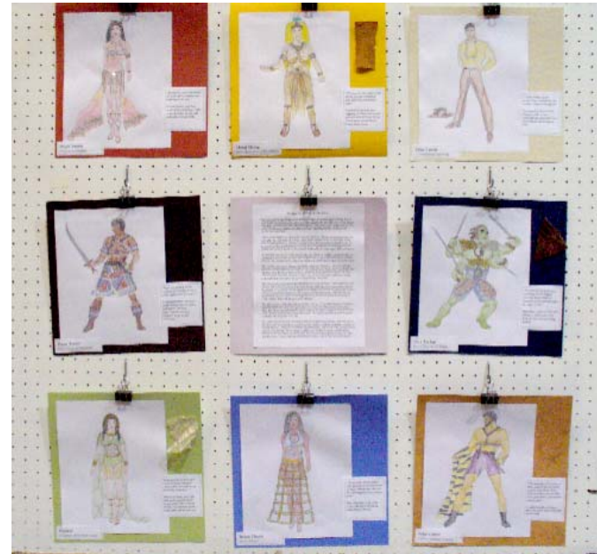
Phil and Kathe used colored pencil