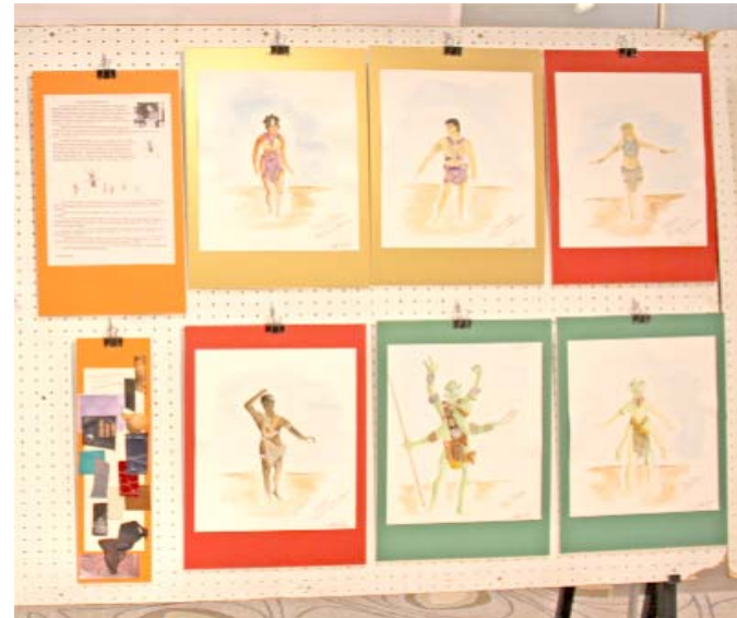
Bruce and Dana created larger-scale watercolor renditions