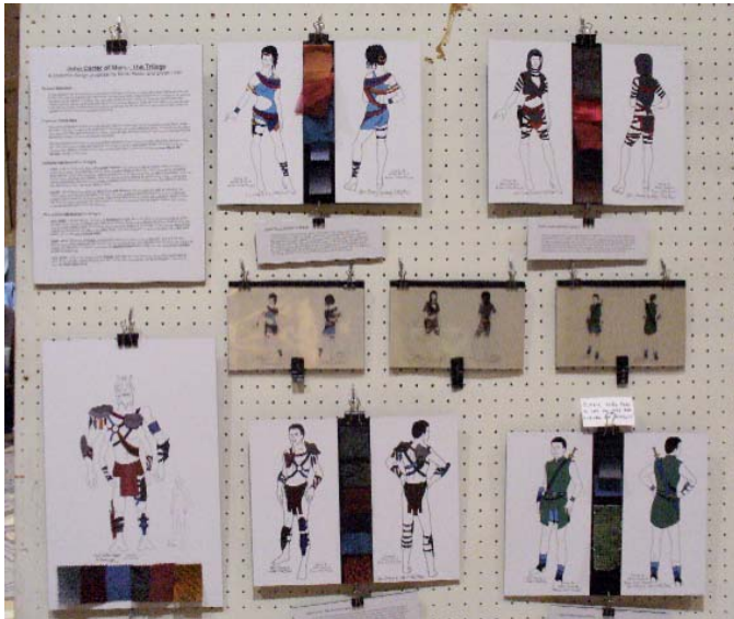
Bryan and Mette used Photoshop and created transparencies to peel away layers of costumes.