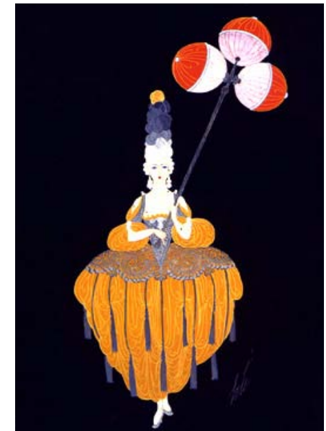
Costume design for a Lantern-bearer in Venise Au XVIII Siècle , Follies-Bergère, 1919.

Erté designed costumes for the dancer Mata Hari and illustrated for the Paris magazine La Gazette du Bon Ton . There followed a 22-year contract with Harper's Bazaar, which not only put Erté on the cover over 240 times, but on the map of high-level design. He also worked with George White's "Scandals" in New York.