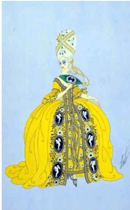
Costume design for Ganna Walska as the Countess in The Marriage of Figaro , Act II, Chicago Opera Company, 1923.

Extravagant, exotic, and romantic designs for the music hall, opera, and the traditional theater ensued, including Hollywood in 1925, when the head of Metro-Goldwyn-Meyer, Louis B. Mayer, invited Erté to design for the cinema.