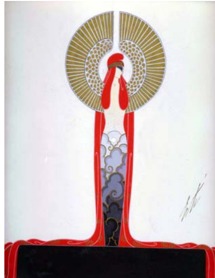
Costume design for the Diamond in Les Pierres Précieuses, Folies-Bergère, Paris, 1923 and Irving Berlin's Music Box Revue, New York, 1924 .

Erté's style stemmed from many sources, from Greek vase designs to Egyptian hieroglyphs, along with Russian, Persian, and Indian influences. He brought what, at the time, was termed "the Orient" to the West, replete with suggestive style and vivid colors, such as crimson, fiery orange, and jade green.