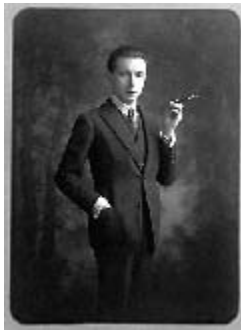
Erté, c. 1920.

This contemporary costume designer epitomizes the Art Deco style through his work in theater, movies, art, and sculpture.