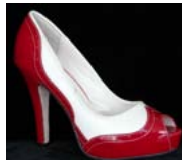
Steve Madden's NLIGHT, 2006.

In the second half of the Twentieth Century, spectator shoes nearly vanished from the scene, but they are enjoying a resurgence of