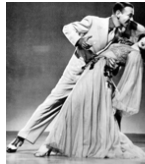
Fred Astaire in “Yolanda and the Thief,” 1945.

In the 1930’s, they took an irreversible step into fashion history when Jazz Age babies, gangsters, zoot suiters, and Swing Era fashionistas adopted the style. Fred Astaire wore them to dazzling effect on the silver screen and the once-sporty brogues got a glossy new look.