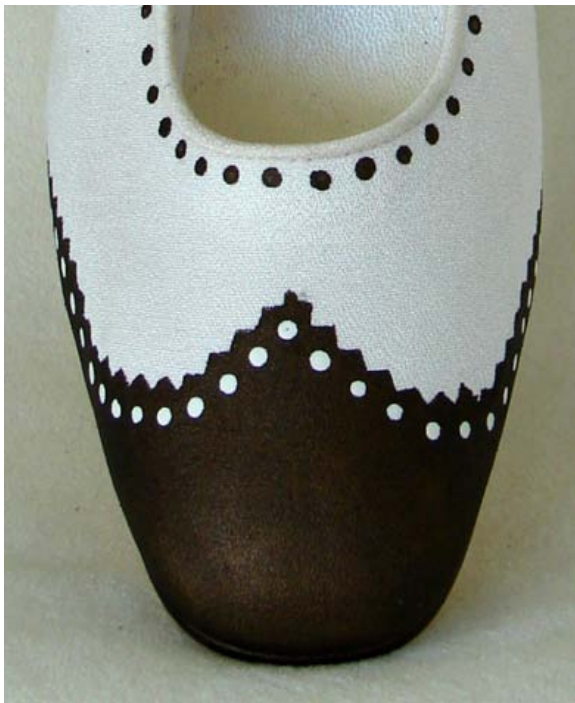
Dots made with Colour Shaper.

Last of all, you want to paint little dots around the “pinked” edge. They are fairly large dots, so a toothpick might not do. Me, I love having the right tool for the job, so I use a silicone-tipped brush called a Colour Shaper (available at larger or online art stores).