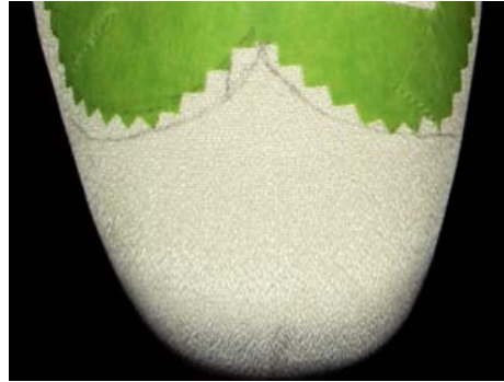
And to a women's shoe.

Next I had to draw the fancy curvy bit on the toe. This was bad, because I can't actually draw. That's when I noticed it looked like an upside down heart. Back to the Internet. I found an outline of a heart, stretched it a little bit to get the shape right, enlarged it so it was approximately the right size for the shoe and printed it out. Then I cut out the heart. I laid it upside down on the toe of the shoe and traced around it.