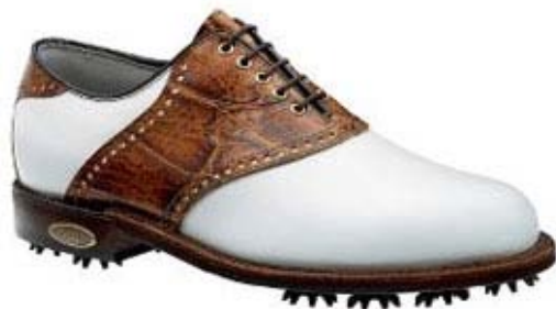
Two-toned “reverse calf” golf shoes worn by the Duke of Windsor in the U.S..

They made their debut in the U.S. in 1925 (golfer Walter Hagen and the Prince of Wales are both credited with that). Soon men and women alike were wearing spectator shoes (called co-respondent shoes in the U.K.) as casual footwear.