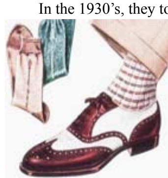
Early ad for men's spectators.

In the 1930’s, they took an irreversible step into fashion history when Jazz Age babies, gangsters, zoot suiters, and Swing Era fashionistas adopted the style. Fred Astaire wore them to dazzling effect on the silver screen and the once-sporty brogues got a glossy new look.