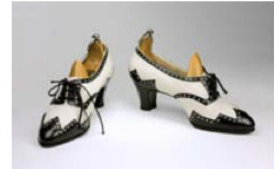
Women's spectators, made by Hellstern and Sons, French, 1925-1930.

Of course, the styling has evolved over the years – the ladies of the 1920's didn't wear stilettos – but for the most part the style has remained true to its basics. These