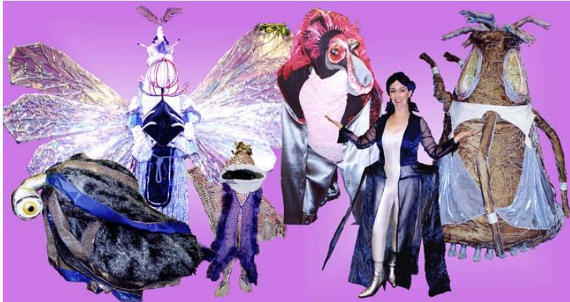
Sentient Species , ConJose (WorldCon, 2002). All but the human were designed and primarily created by Bruce and Dana.

Kevin: Several things... one is the ability to make a bit of fantasy or art come to life in three dimensions, and by so doing, to draw the audience/onlookers/passersby into that artistic vision with you.