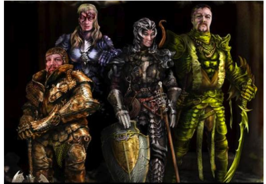
Detail of the armored characters from "The 4 Paladins".

A hallmark of D&D is the rule books and magazines. Things started out with just a simple rule book, but a whole range of publications has grown up around the game. Full-length articles often appear now, with detailed