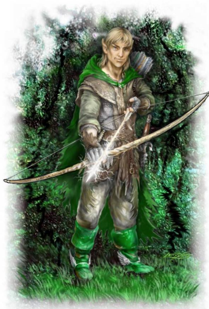
Soveliss the Ranger from the D&D Epic Level Handbook.

Since this is an Epic Level, I figured that by this point, the only thing someone is going to care about is their magic items.