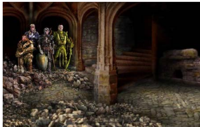
"The 4 Paladins" digital image created for D&D v. 3.5.

When I thought about the types of costumes for this story, I wanted to have a different style for each species that appears in the illustration. I also didn't want it to look like it was lifted directly from a Medieval museum, or from Lord of the Rings for that matter, so I mixed it up a lot.