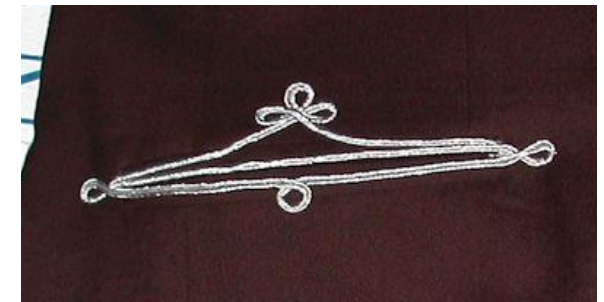
Detail of the braid at the pockets.

After the body of the coat was assembled, I decided it did not have nearly enough silver braid on it! I looked for blank spaces on the front, and added more braid. I outlined the pocket openings with soutache cord. The hardest part here was hiding the ends of the cord.