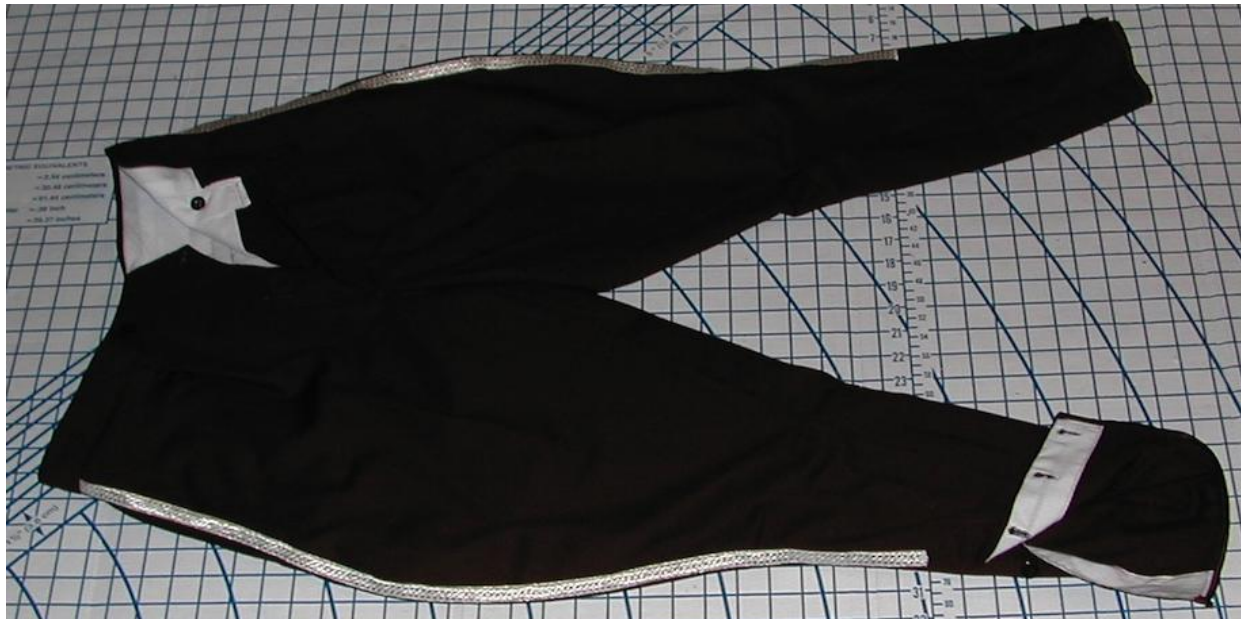
The breeches button at the cuffs to fit in the boots. The rounded Cossack-style shape is clearly seen.

The suit is made of suit-weight wool, lightly interfaced with hair cloth, and lined in silk of a matching brown shade. Flat, half-inch wide silver braid was used for the main parts of the braiding, which was itself decorated with quarter-inch soutache cord (russia braid).