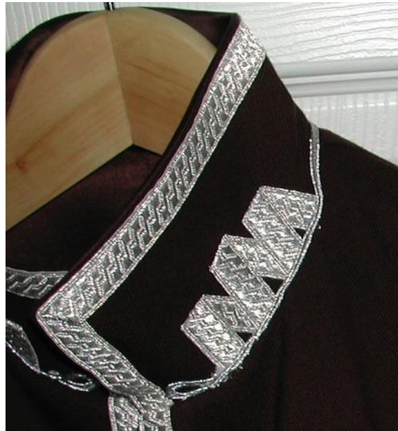
Detail of the collar. The wide braid forms three stylized mountains. The loop in the soutache cord at the front serves to conceal the end of the cord.

The collar has a very stylized three mountains on it, made from the wide silver braid. I experimented with a number different ideas here, but this one seemed to read the best. It was also one of the last things that got done, when time started to become pressing.