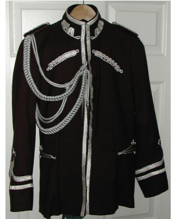
Front of coat.

The epaulettes and aiguillette are formerly of the East German Volksarmee , which went out of business in 1991 and sold off their entire supply at very low prices. Unfortunately, as the supply has dried up, it has become harder to find things like this, and the prices have also gone up. It would have been a lot more expensive to make this costume today than it was ten years ago. The epaulettes were originally for a major of the transport services. They were carefully taken apart and the blue felt backing replaced by the same brown wool as I used for the suit.