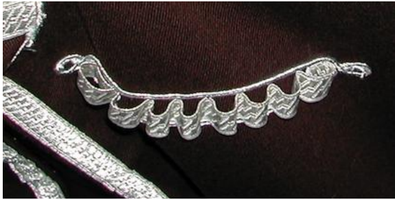
Detail of the Cossack-style cartridge loops on the upper chest.

I also needed some more decoration in the upper chest area, where Cossack coats have loops to hold rifle cartridges. This also gave the uniform more of a Russian look.