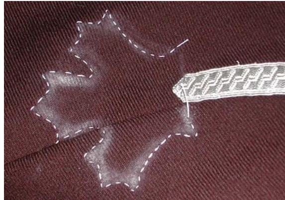
The maple leaves on the back are marked out in chalk and basting stitches.

Inspiration here came from the Dress Regulations of the Army, 1900 , as all twelve British hussar regiments had different variations of this same style. Each section of curved braid has a maple leaf outlined in soutache cord at the top, part of the