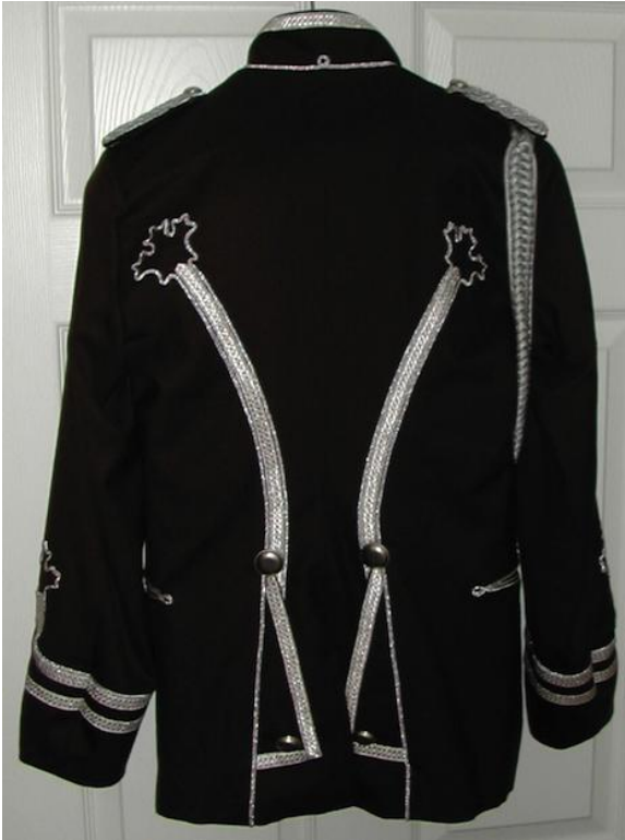
Back of coat.

the badge (three mountains, a maple leaf) into the uniform, rather than have it represented by patches sewn on at the last step, as they would be had I embroidered separate badges. The back of the jacket features the Vorkosigan maple leaf motif in a very hussar-style decoration, with the curved braiding following the seams on the back.