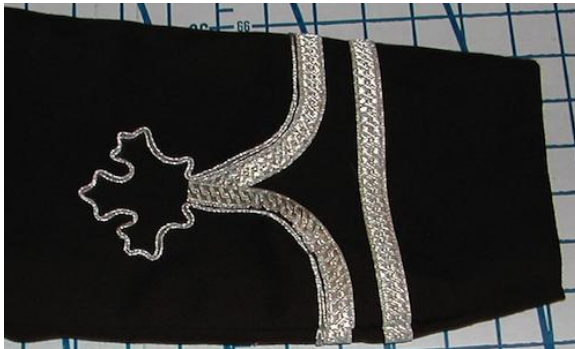
Detail of the sleeve braid, the soutache cord forms a maple leaf and outlines the wider braid.

The sleeves were heavily braided too. If I ever were to redo this costume, I would add two smaller points on either side of the main point on the wide silver braid on the sleeve - to echo the three mountains of the Vorkosigan badge.