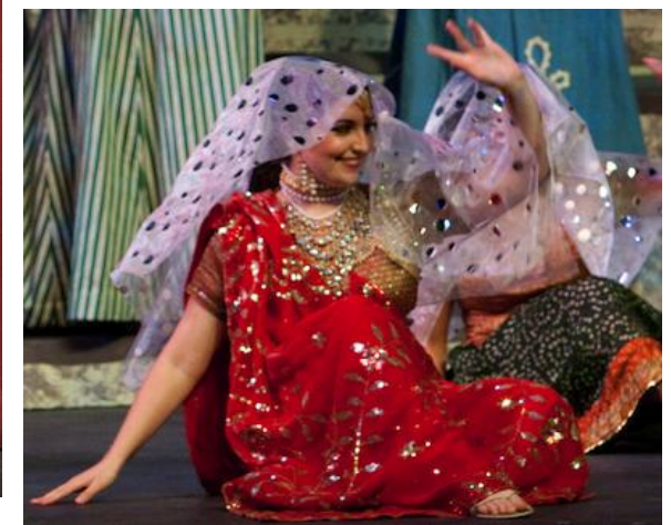
"Fusion" dress from Ebay.