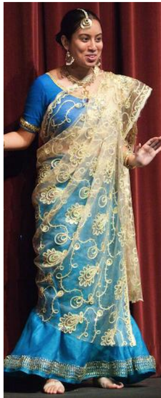
Actor wears saree.

With the garments that the Indian members of the cast contributed, we began to piece together some of