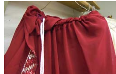
Saree attached to petticoat waist.