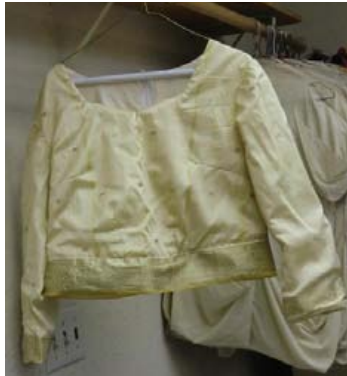
Choli made from part of a saree

Fabric. Since I could not afford to buy the garments, I had to think of making at least a few of them. The problem was that there is very little true Indian fabric available in the area, especially fancier beaded fabrics. Solid material at fabric stores have a modern, processed look, and I wanted more texture. They also had what my assistant dubbed "acid looking"