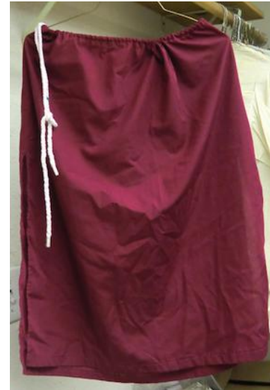
Petticoat of wedding saree.

The plan was to have as many turbans as possible on stage to help recreate the period. I was worried how to get them to stay on without "making" them. As it turned out the men who were to wear the turbans actually knew how to tie them, so that they would stay on their heads. It was so much fun to watch them wrapping those long pieces of cloth. They were really good. I did give them the turban cloth for rehearsal about three weeks before opening, so they could get use to