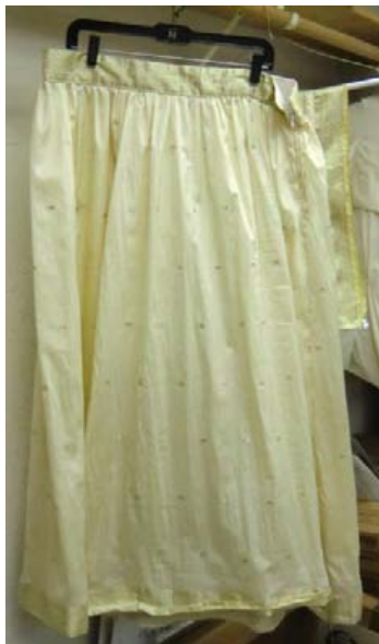
Lehenga made from the other part of the saree.