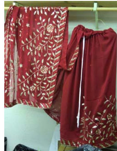
Saree w/ attached petticoat.

having something on their head while dancing.