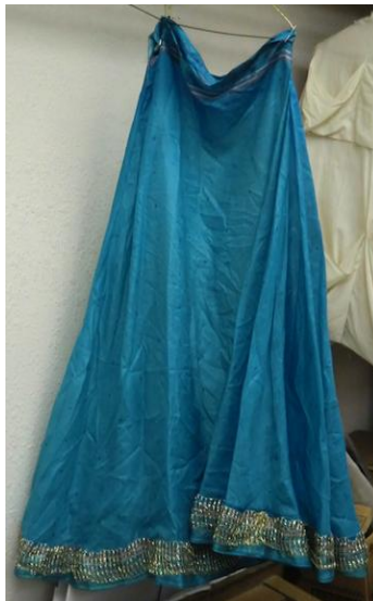
Lehenga made from saree

colors. This describes the harsher look of polyesters that take color much differently than cotton.