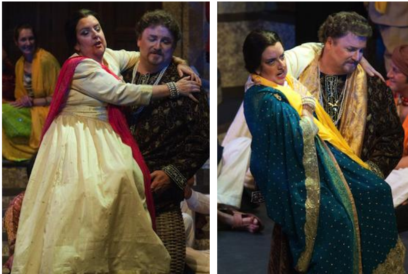
Beige was replaced by a color to reduce the brightness of the woman's costume under stage lighting.

Local Shops. My friend took me to some of the local Indian clothing shops, where the world of Indian dress took on a whole new meaning. I could also go online