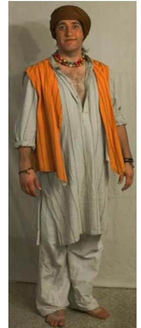
Vest made of bed sheet.

Ebay. Wedding dresses are very expensive: $2500 and up. I found a "fusion" dress (below), a combination of the traditional style of Indian dress and modern Indian dress, at a more reasonable price.