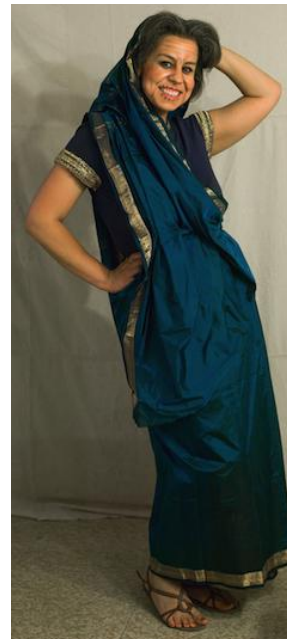
Choli made of Navy T-shirt.

the pieces had the truly “high class look” we wanted. What they lacked was the intricate beading and embroidery that would catch the lights, even though we had put glittery trim on the skirt hems and choli tops. I made one “choli” (below at left) out of a navy T-shirt and trimmed it with sequined trim.