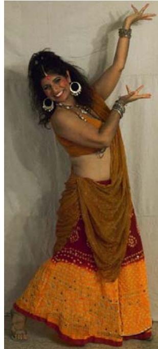
My jewelry assistant.

women wore chokers (some of which were made out of pearls and gold laced trim), large earrings, necklaces, rings, lots of bracelets and tikkas (a