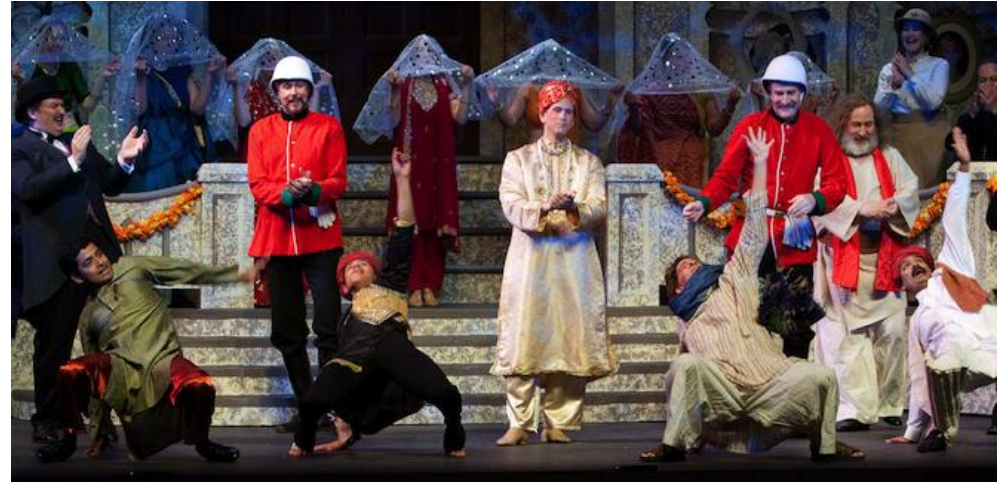
Men's doitis were replaced by pajamas and kurtas.

The Cast. We had several Indian men and women in our cast and I began to talk to them and ask whether they had garments that could be used in the show. They turned out to be a wonderful resource.