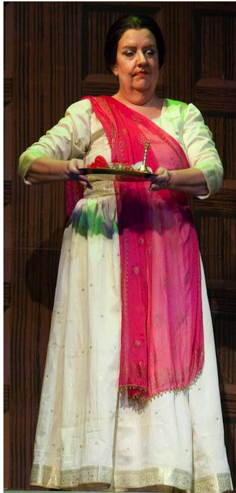
Actor in Choli and Lehenga.