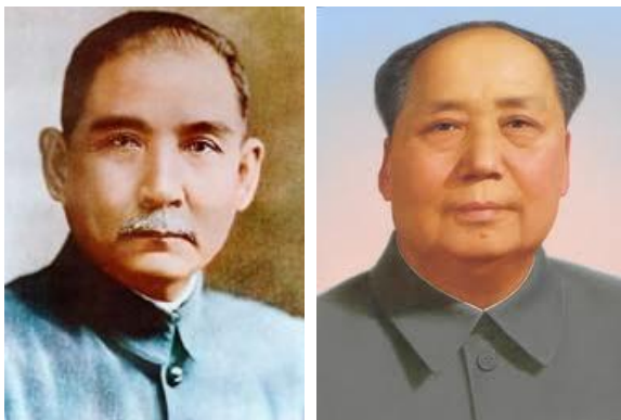
Portraits of China's late Chairman Mao Zedong (right) and Sun Zhongshan (left), who is often spoken of as the father of modern China, wearing Zhongshan suits.

Chinese leader Sun Zhongshan (Sun Yat-sen) first introduced it shortly after the