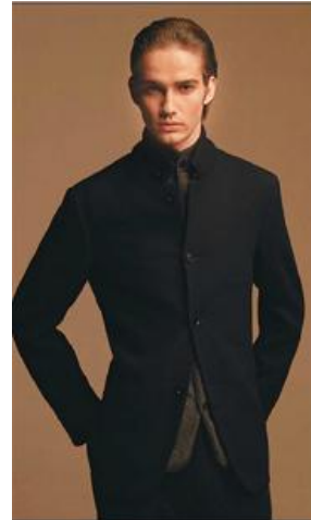
Modern Mao suit.

The modern Mao suit can have shiny copper buttons instead of gray plastic ones, and a slim-cut. The four pockets have been cut out. The suits are made from synthetic fibers and silk rather than just cotton. It can also be embroidered and accessorized with scarves, leather bags and boots.