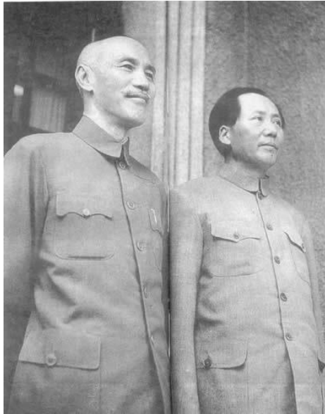
General Jiǎng Jièshí (Chiang Kai-shek) with Mao Zedong.

became a symbol of proletarian unity in the Republic of China, and was regularly worn at official functions through the 1990s. It has only recently given way to Western style business suits.