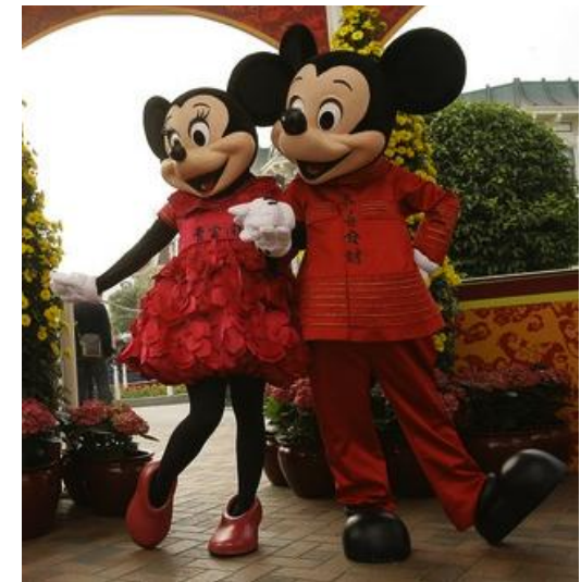
Mickey and Minnie in Mao-inspired costumes at Hong Kong Disneyland.

Even Disney is getting into the act with Mao-inspired outfits for Micky and Minnie by fashion designer Vivienne Tam at Hong Kong Disneyland. It is part of their efforts to boost its appeal to Chinese tourists.