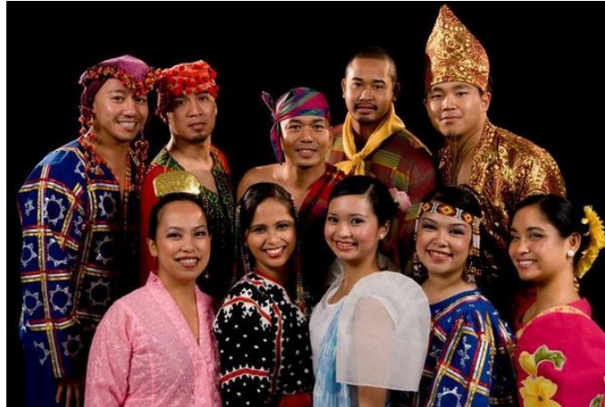
Members of the Parangal Dance Company.

So, now that we all know more about Filipino costuming, I'm looking forward to seeing more Filipino attire and Filipino-inspired costumes at conventions and balls, and maybe even some of the Filipino events in the Bay Area, in the future. Although there aren't a lot of reference materials and patterns that one can avail of, I'm sure the