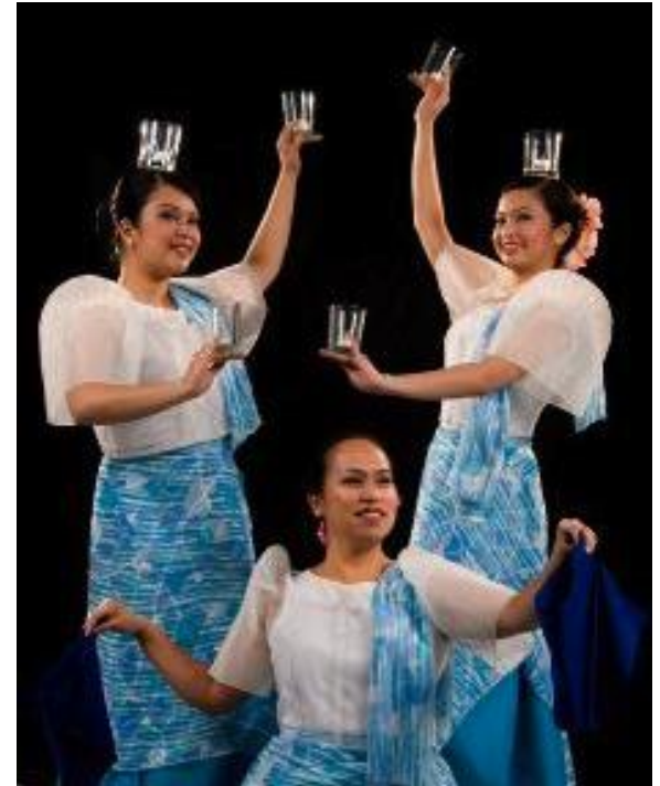
Pandanggo sa llaw.