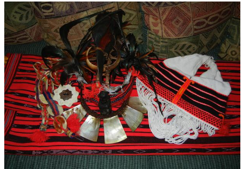
Ifugao ceremonial attire.