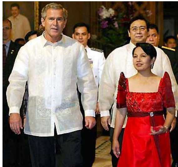
U.S. President George W. Bush wearing a Barong Tagalog accompanies Philippine President Gloria Macapagal-Arroyo wearing a Terno.

Granted, China, Japan and India are major world cultures with large populations in their own countries and around the world,