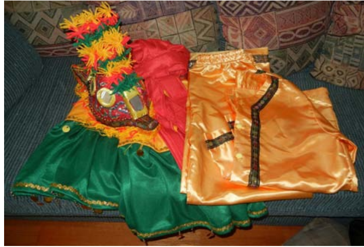
Maguindanao Sagayan attire.