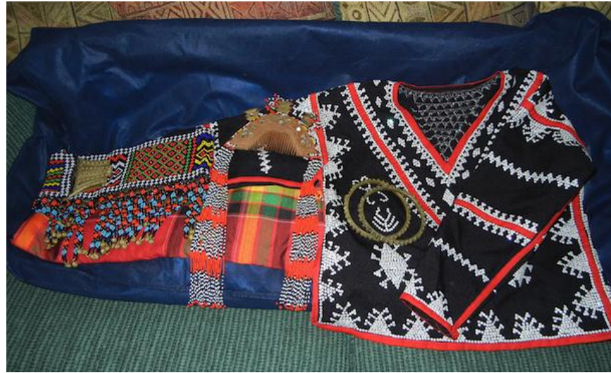
T'Boli attire.